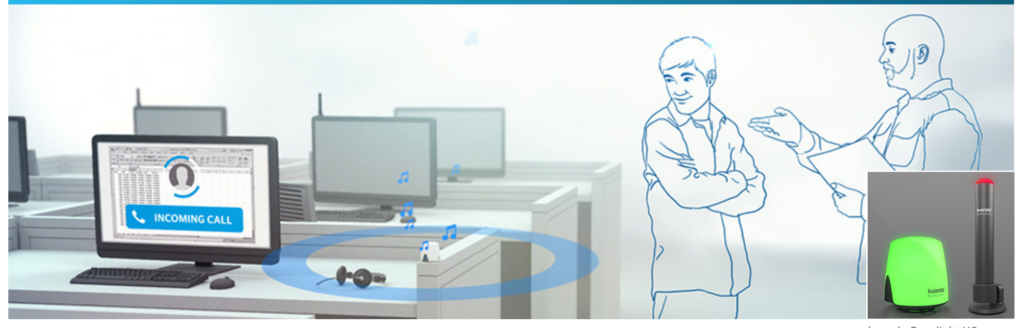
kuando Busylight UC.