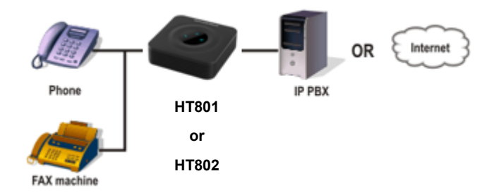
Figure 5: Connecting the HT801/HT802

Power, Ethernet and Phone LEDs will be solidly lit when the HT801/HT802 is ready for use.