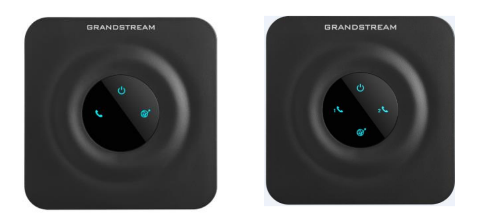
Figure 6: HT801/HT802 LEDs Pattern

There are 3 LED buttons on HT801 and 4 LED buttons on HT802 that help you manage the status of your Handy Tone.